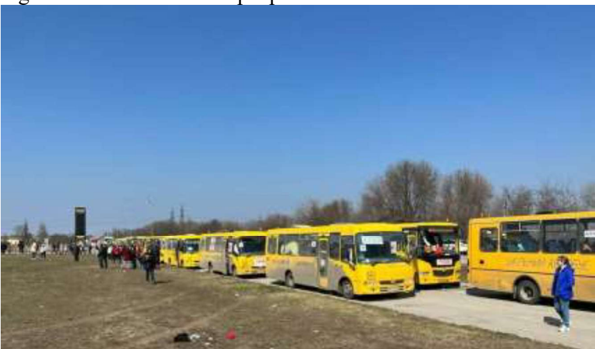
Evacuation via the town of Vasylivka