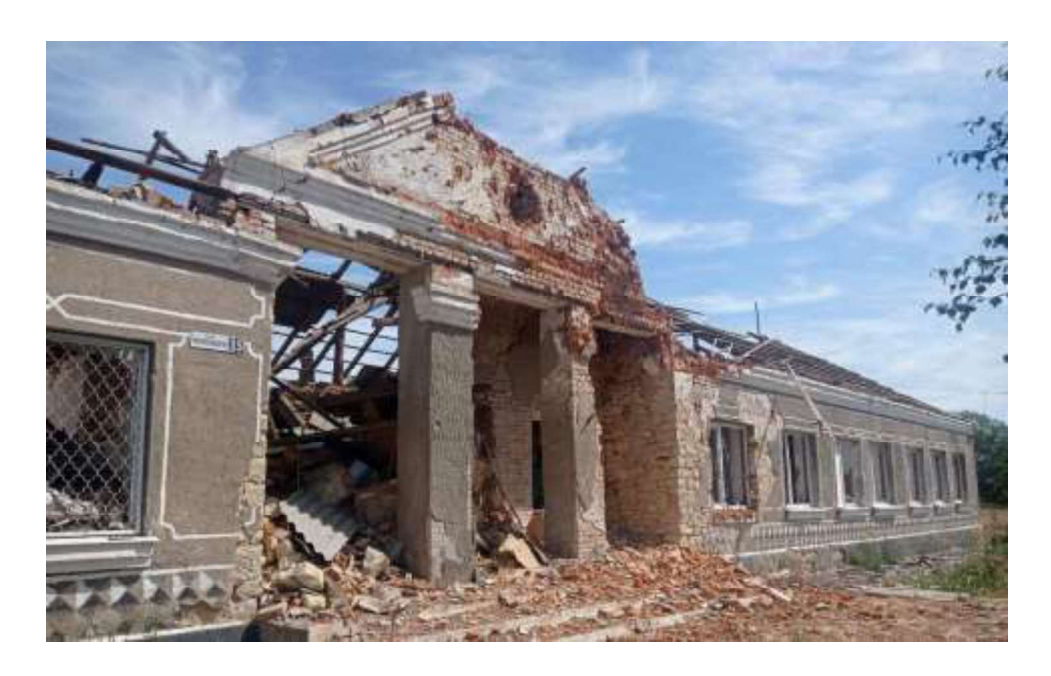
Ruined school and buildings