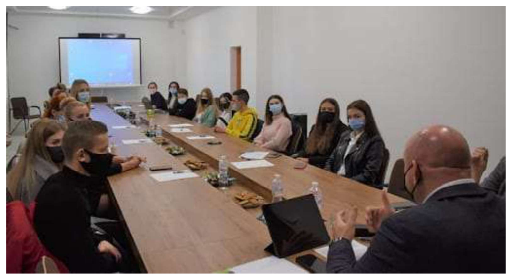
Youth Council meeting

As part of the Major Construction program, the reconstruction of the Tavria stadium is underway: the football field and running tracks have been covered with artificial surfaces and markings, and the gates have been installed. A fence and a tennis court have been installed and the existing stands have been renovated.