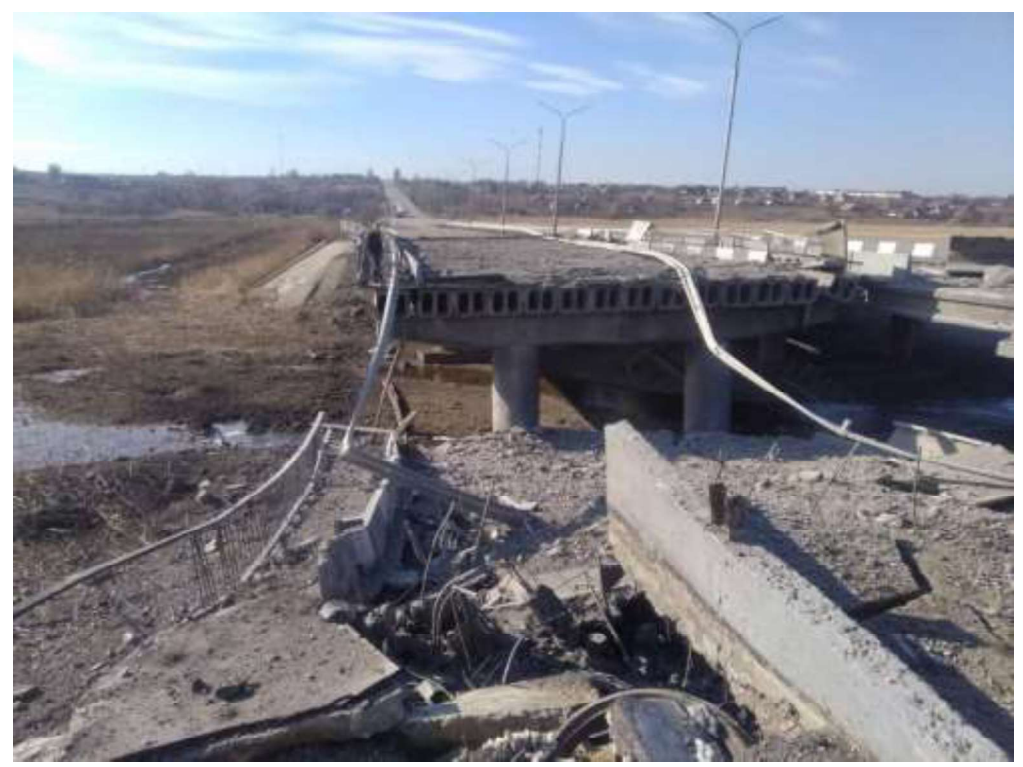
A ruined bridge through the village of Kamianske