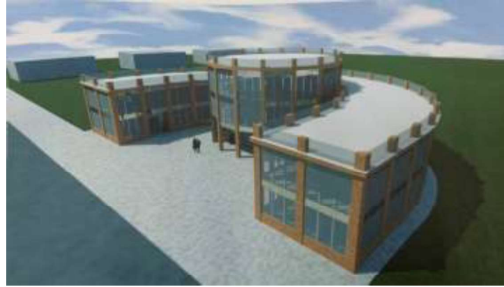
Dia Centre Project

One of the strategic areas is the intelligent development of territories. In particular, this means supporting small and medium-sized businesses, developing a system of quality services in the Community. A cultural services centre and an inclusive sports and playground will also be built.