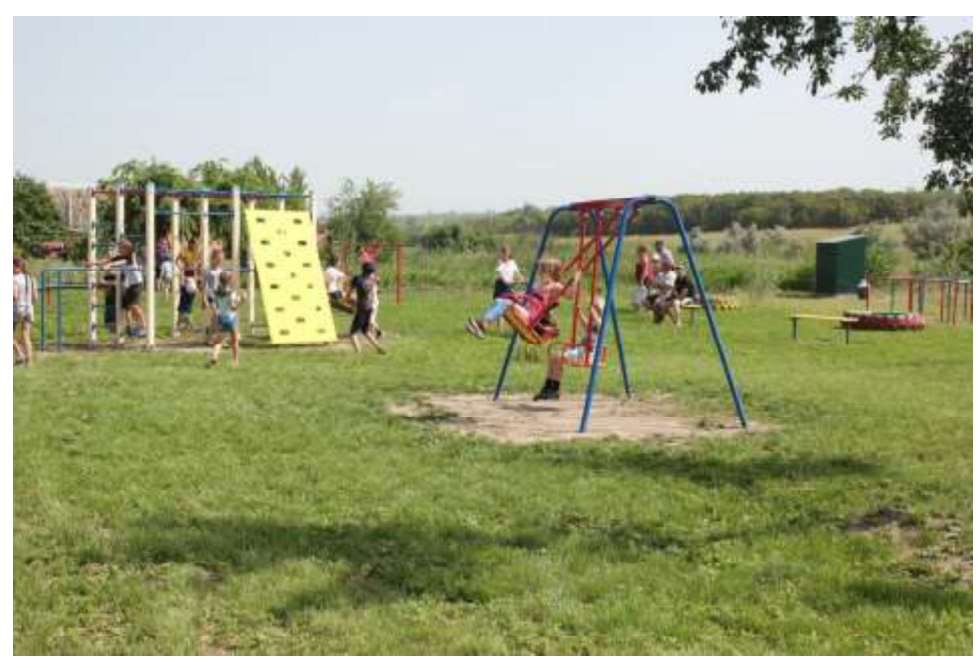
Children's sports ground

In the Community, a Youth Council was set up under the Vasylivka Town Council in order to establish effective interaction between the local self-government and young people.