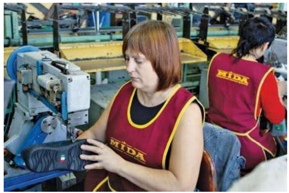
Making MIDA TM shoes

Due to its exceptional reliability, modern design, reasonable price and long-standing presence in the footwear market, the Ukrainian brand MIDA has gained the recognition and trust of millions of consumers in different countries. Shoes made only from high-quality natural materials, modern equipment of the factory and constant quality control at all the stages of production are the key to the success of MIDA TM.