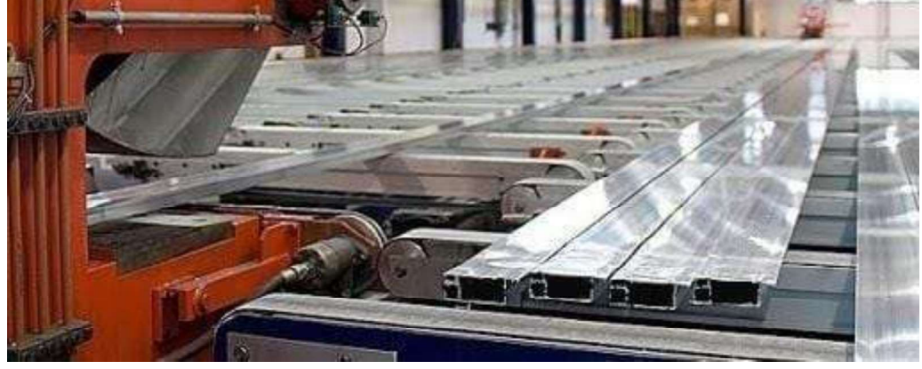
Vasylivka Factory of Technological Equipment

Vasylivka Factory of Technological Equipment specializes in the manufacture of metallurgical and electrotechnical products, the production of aluminium profiles. The plant's products are supplied to the domestic market of Ukraine and the European countries. In the regions of Ukraine, Vasylivka Factory of Technological Equipment is the only manufacturer of these products.