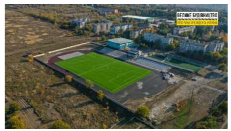
Reconstructed Tavria stadium

As part of the Major Construction program, the reconstruction of the Tavria stadium is underway: the football field and running tracks have been covered with artificial surfaces and markings, and the gates have been installed. A fence and a tennis court have been installed and the existing stands have been renovated.