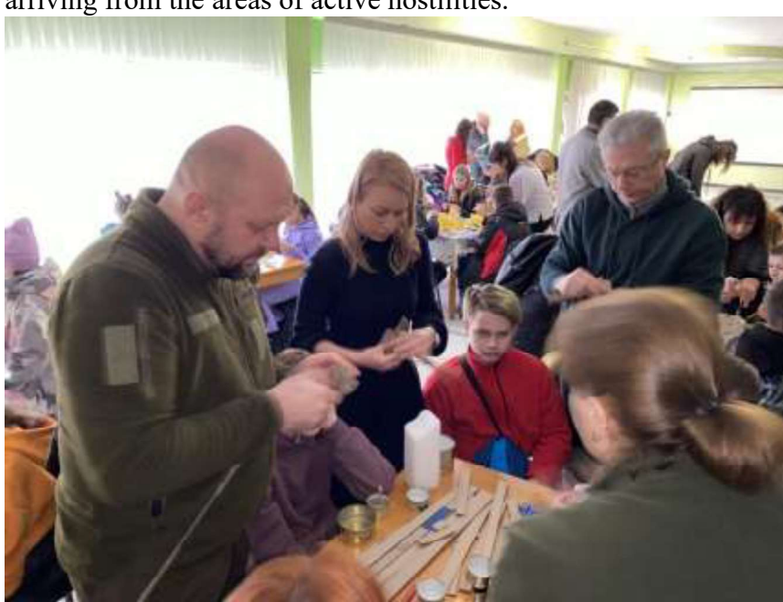
Coordination and humanitarian centre

Currently, a large percentage of forced refugees from the Vasylivka Community are staying in the city of Zaporizhzhia. A coordination and humanitarian centre has been opened in Zaporizhzhia to support people arriving from the areas of active hostilities.