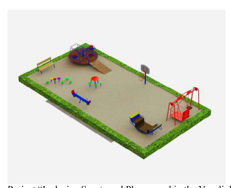
Project "Inclusive Sports and Playground in the Vasylivka Community"