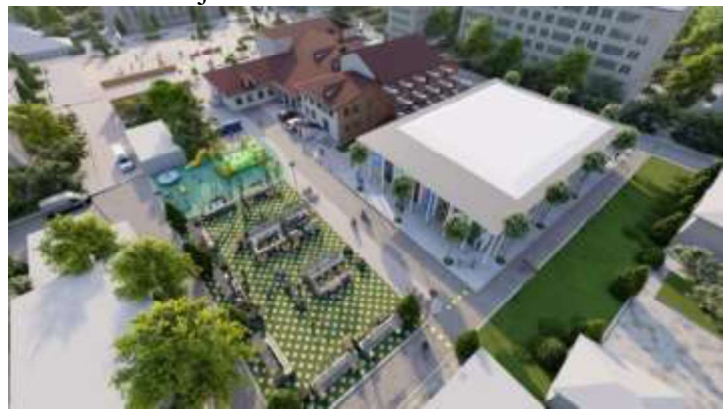
Cultural Services Centre project