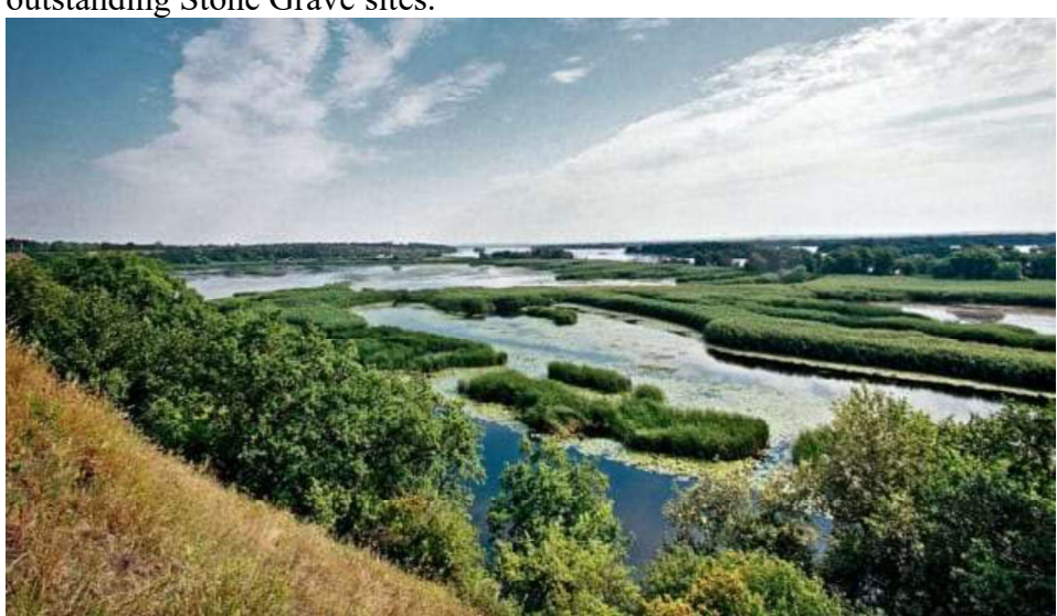
Big Meadow Source

The territory of the Community has great potential and excellent natural opportunities for attracting additional resources to its socio-economic development through tourism. There is a tourist route from the Khortytsia National Reserve and tourist sites of Zaporizhzhia in the north of the region and to the outstanding Stone Grave sites.