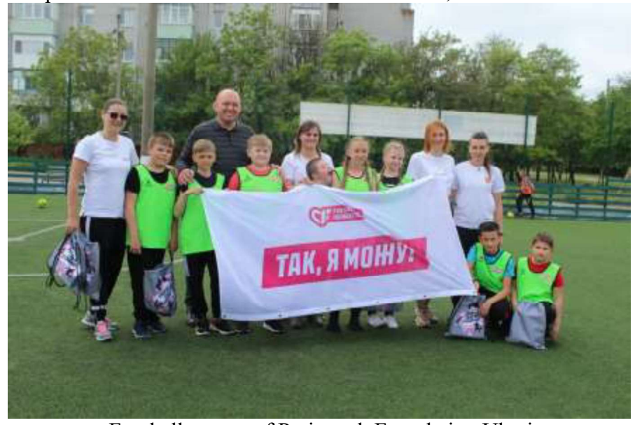
Football as part of Parimatch Foundation Ukraine

Cooperation with Parimatch Foundation Ukraine, an international charitable foundation, has also started.